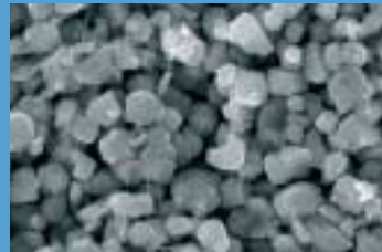
Standard phosphor plate